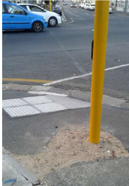
Main & Recreation Roads