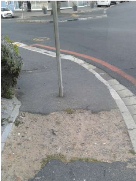
Beach & Recreation Roads

The current reinstatement of the pavement / sidewalk surfaces being done by fibre contractors highlights the terrible state of the original surface done by the City (not affected by the fibre installers).