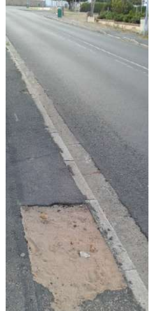
Recreation Road (4th & 5th Ave)

There seems to be missed opportunities and several issues, some which may be immediately resolvable and others seemingly stem from early design / planning considerations.